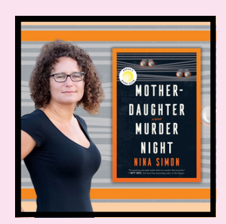
A Murder Mystery, Family Story, & Love Letter to Strong Women Everywhere