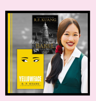
Asian American Representation in Literature