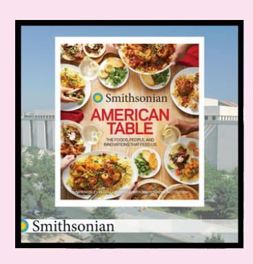
The Foods, People, and Innovations That Feed Us