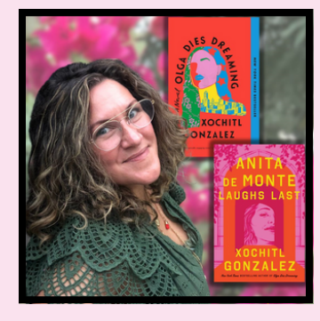
A Literary Examination of Power, Love, and Art